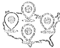
Can happen anywhere